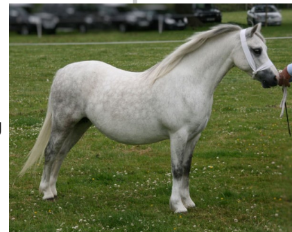
Welsh Sec A

Action:- Action must be quick, free and straight from the shoulder, knees and hocks well flexed with straight and powerful leverage well under the body.